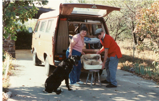
Camping with everything, including the Kitchen Sink!