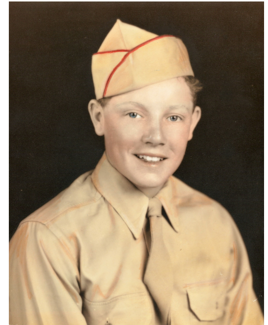
Young Army Enlistee - 1946